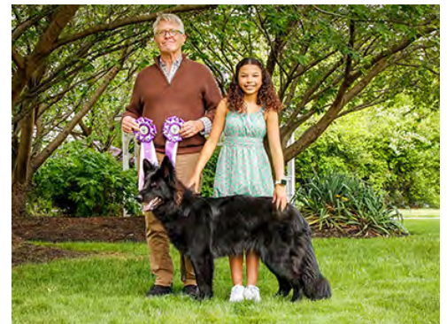
Best Jr Puppy - Meea