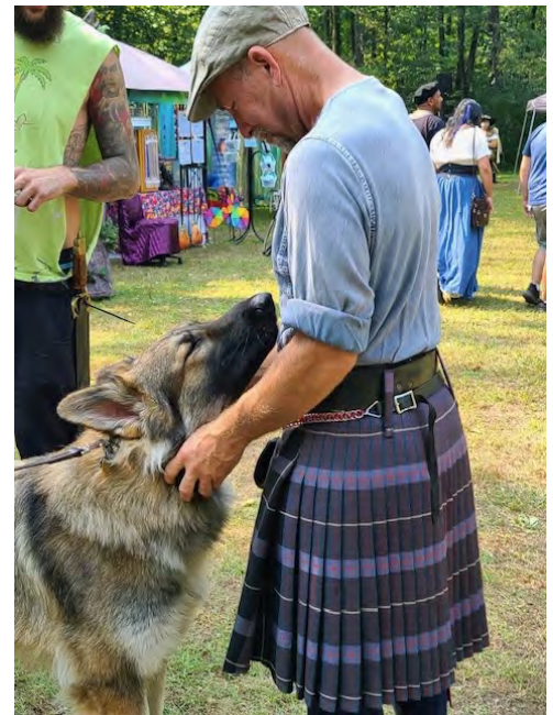
Royal Dog Days