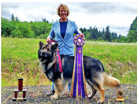
Best of Breed - Ruckus