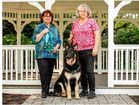
Best of Opposite - Briza