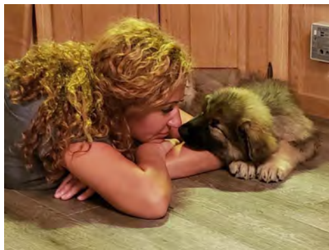
Love at first sight.