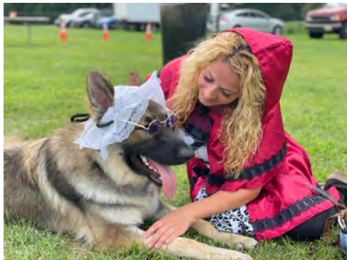
Big bad wolf; we don't think so!