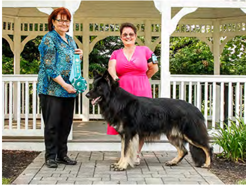
Best of Breed - $teele