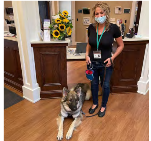
Vintage Shiloh's Oso Del Cielo aka Oso b. 5/27/2020 | Hercules/Grace