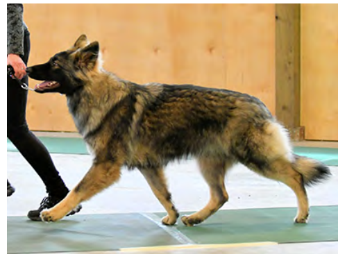
Best Jr Puppy - Betty