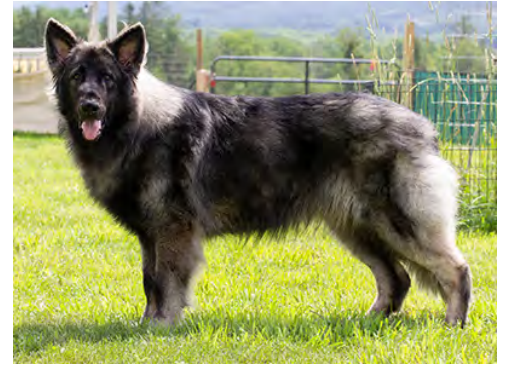
Best Jr Puppy - Kepler