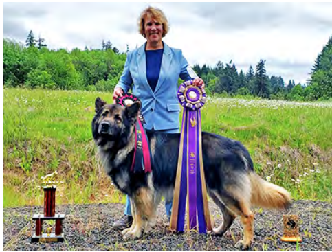
Best of Breed - Ruckus