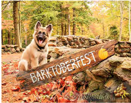
Caledonia State Park, Fayetteville PA