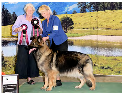
Best of Opposite - Ponzi