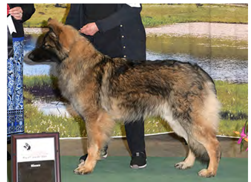
Best Jr Puppy - Roi