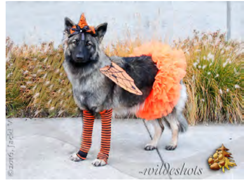
IABCA Evergreen Autumn Sieger, Ridgefield WA