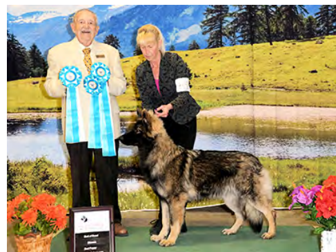
Best Jr Puppy - Betty