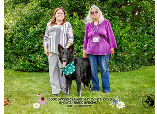
Best Jr Puppy - Maeve